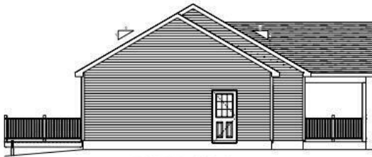
LEFT ELEVATION SCALE: 1/4" = 1'-0"