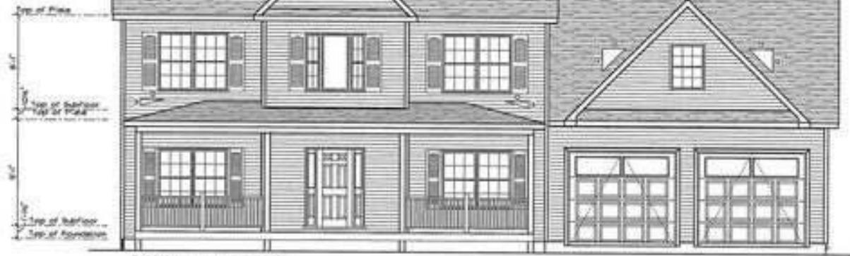
FRONT ELEVATION SCALE 1/4" = 1'-0"