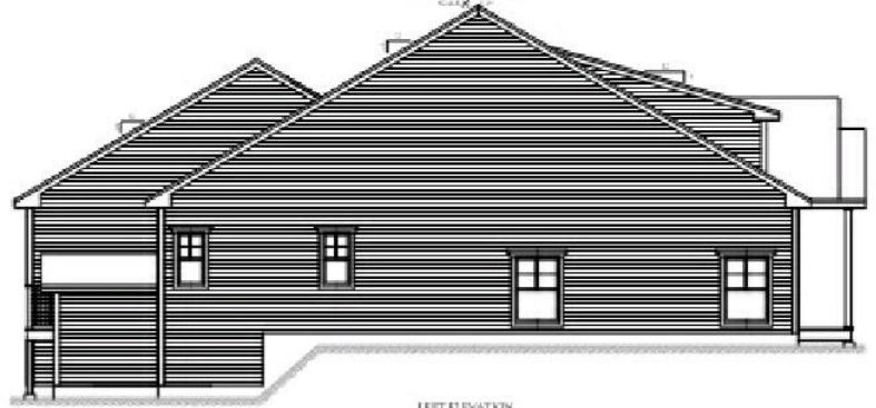
LEFT ELEVATION SCALE: 1/8" = 1'-0"