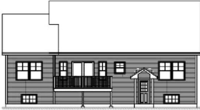
REAR ELEVATION SCALE: 1/8" = 1'-0"